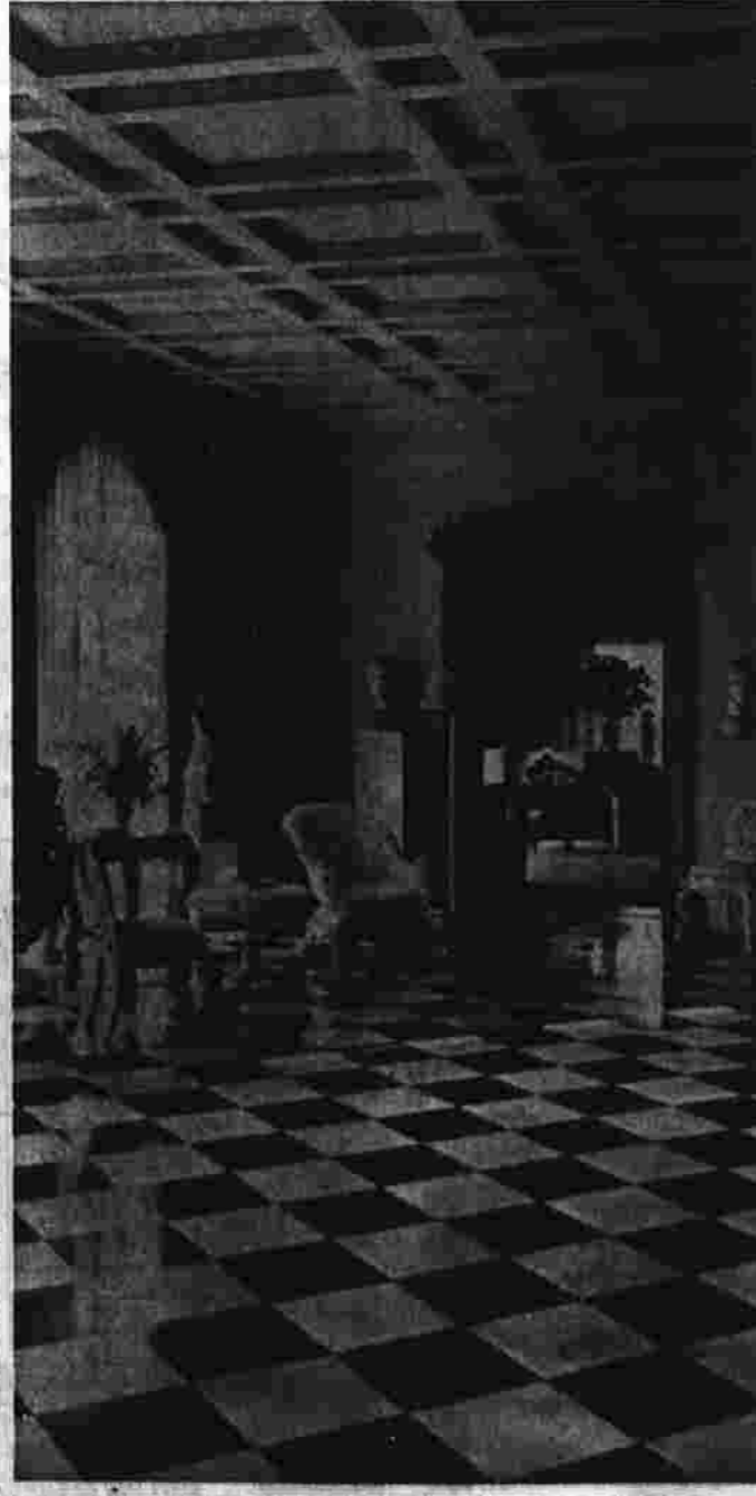
Foyer in the penthouse home of Mme. Rubinstein. Sculptures are by Eli Nadelman, whom she helped and patronized during his early years. Teakwood chairs and table are painted white. Floor is marble. Over the doors are rare pieces of primitive sculpture from Mme. Rubinstein's world-famous collection.